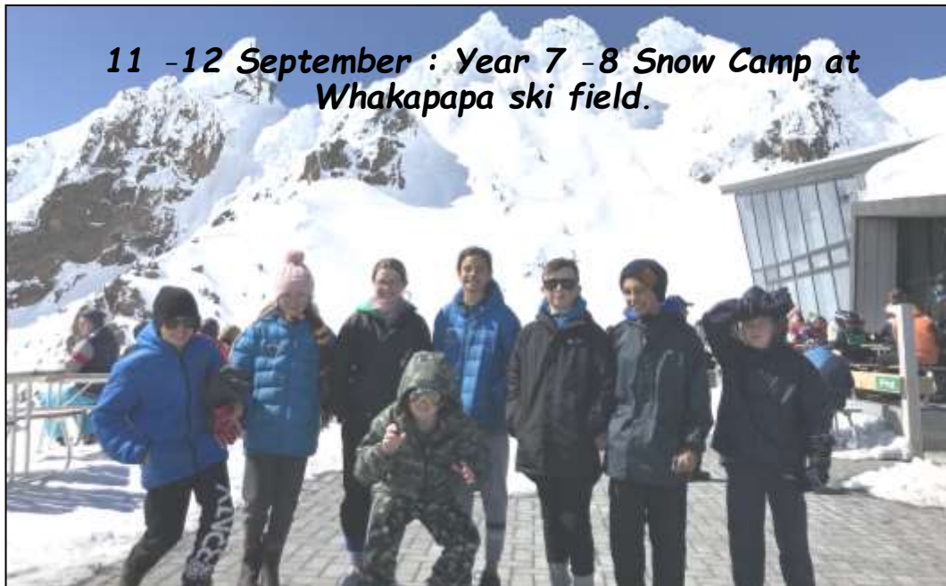
11 -12 September : Year 7 -8 Snow Camp at Whakapapa ski field.